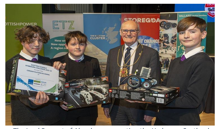
The Lord Provost of Aberdeen supporting the Hydrogen Scotland Education Programme in Aberdeen