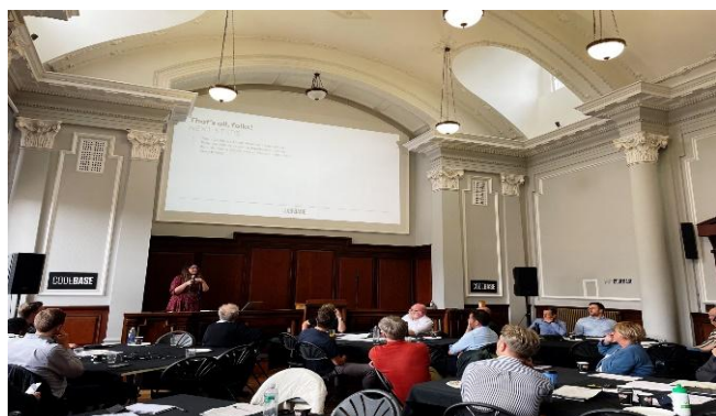
Officers from across Scottish Cities attending Codebase workshop in Stirling, August 2024