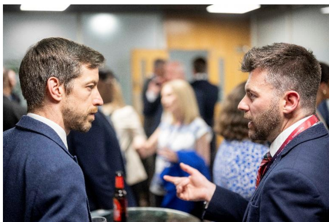
Networking events were hosted at UKREiiF 2024 in partnership with Phoenix Group, and with the National Wealth Fund and Key Cities