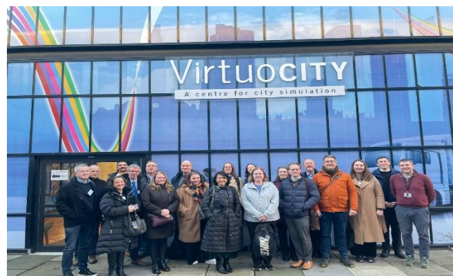
Officers from Aberdeen, Dunfermline, Dundee, and Glasgow represented the Alliance at Joining the Dots Connected Places Catapult Programme in Leeds.