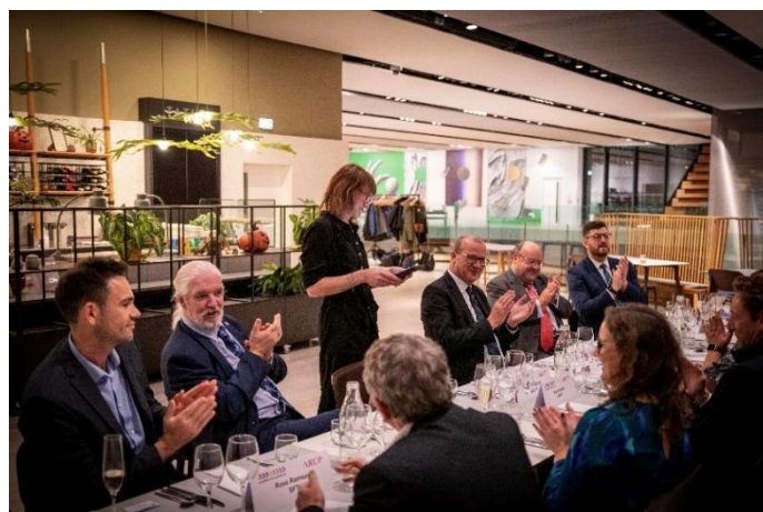
City Leaders and City of London's Policy Chairman at dinner hosted with Arup at V&A Dundee