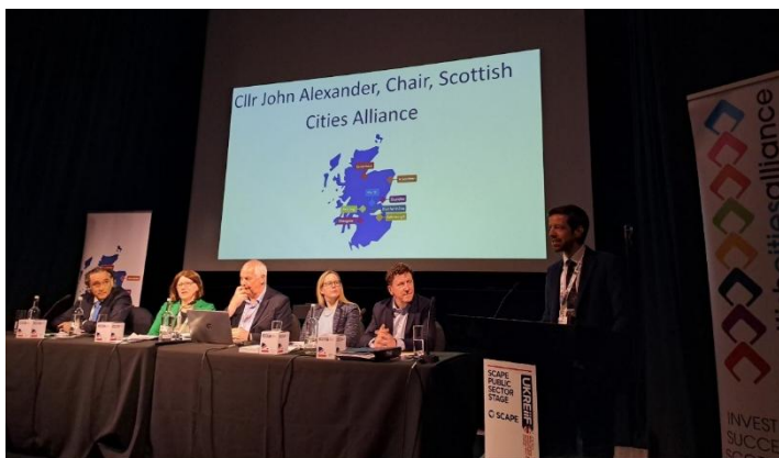
The Alliance Chair giving welcome remarks to delegates at the Alliance's panel discussion focused on the investment opportunities linked to Scotland's Green Freeports and Investment Zones.