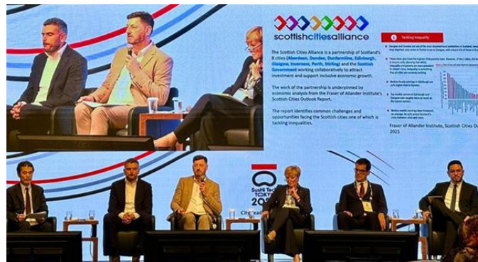
The City of Edinburgh Council representing the Alliance at the G-NETS Leaders Summit in Tokyo, May 2024