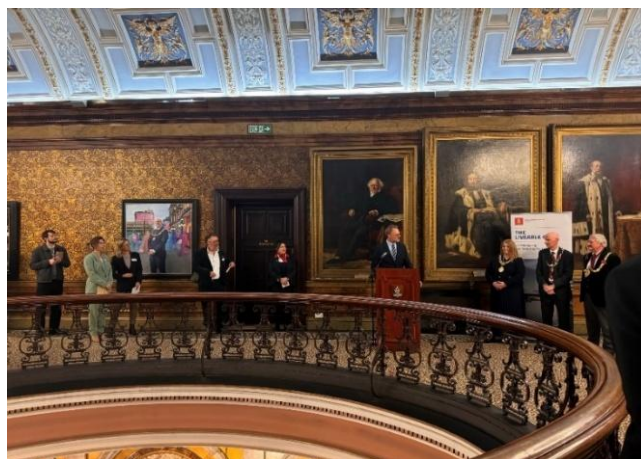
Denmark's Ambassador to the UK alongside Glasgow's Lord Provost at the Liveable Cities Networking Reception in Glasgow City Chambers