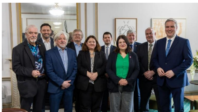
Alliance Leadership Group alongside Kirsty McNeill MP, Parliamentary Under-Secretary of State for Scotland